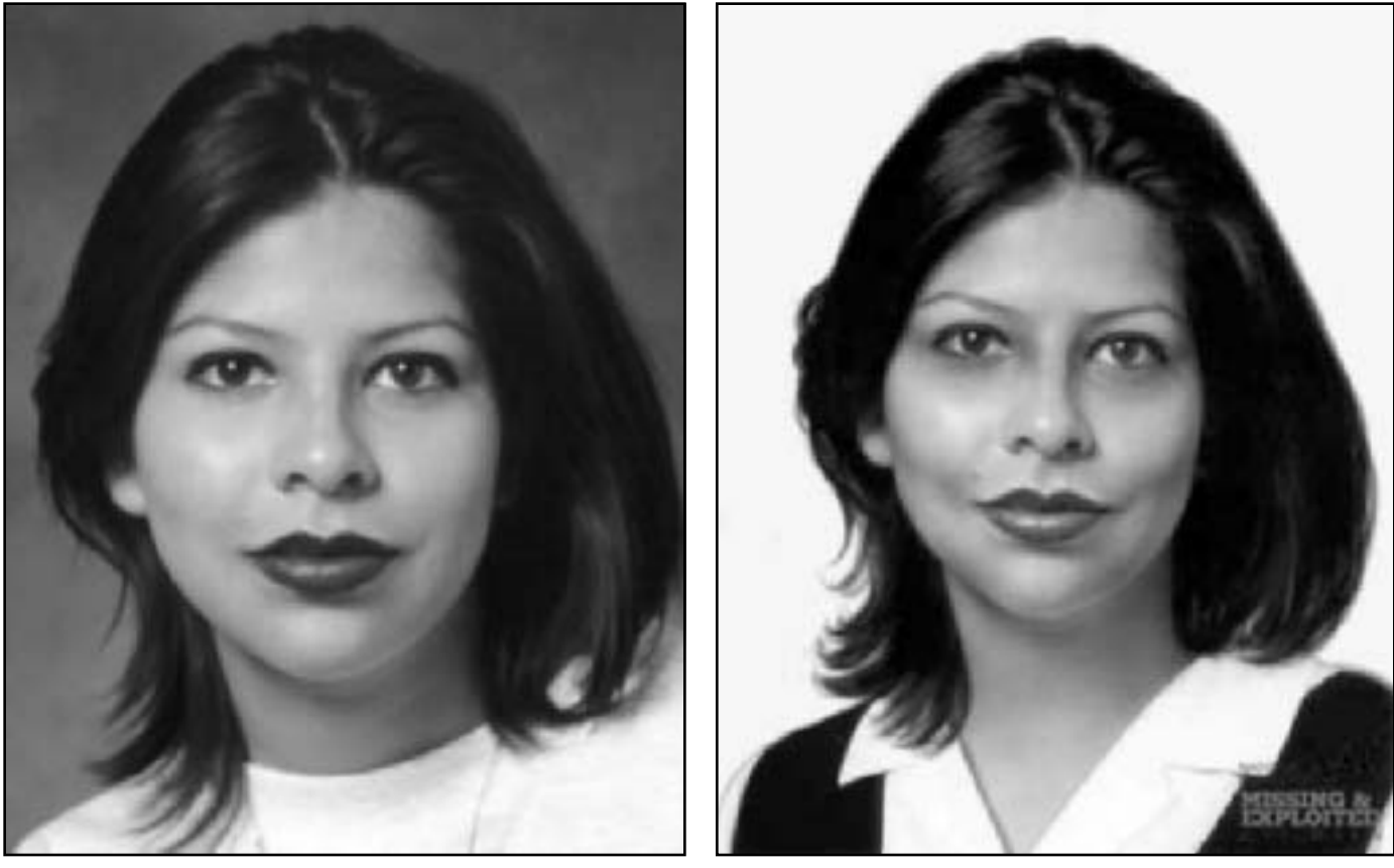
Female, Age Now: 19 Brown eyes, Brown hair